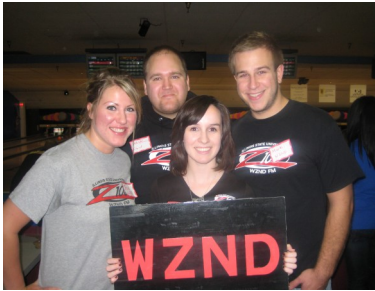
2009 WZND Turkey Bowl Team