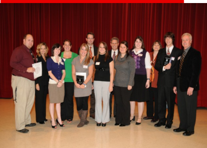
WZND Silver Dome Winners with ISU SoC Faculty.

The winners were announced at IBA-U, a one-day student conference for broadcasting students from all over the state of Illinois on Friday, October 2, 2009. The awards were presented at the Silver Dome Luncheon, held in the Brown Ballroom at Illinois State University.