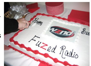
Celebrating WZND's Birthday

Overall, the format change has been very positive and proved to be a great choice for WZND staff and listeners. It has also been a wonderful learning experience. And it happened at just the right time. Our new format is perfect for our new frequency. Listen in at 103.3 and www.wznd.com !