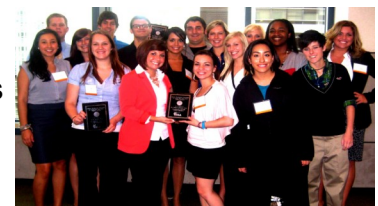
WZND Directors that attended the conference.