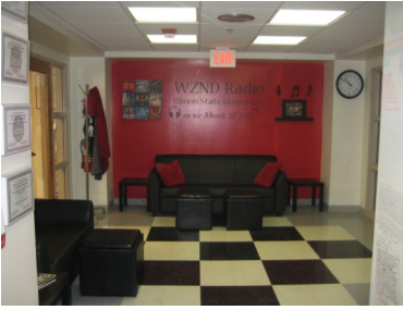
WZND's new lobby