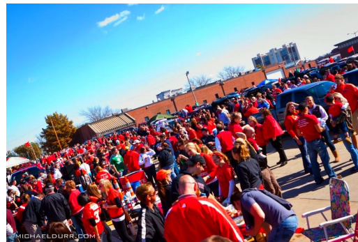
The Tailgate with everyone wearing their WZND jerseys!